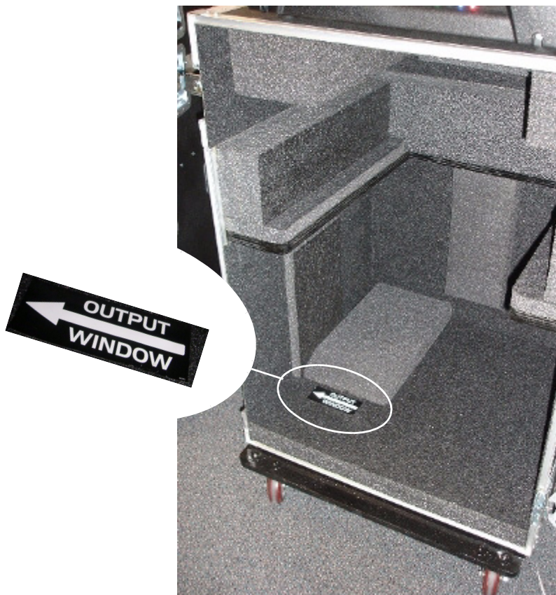
Figure 1: Orientation for fixture positioning sticker.

Orient the enclosed sticker in the roadcase as shown in Figure 1.